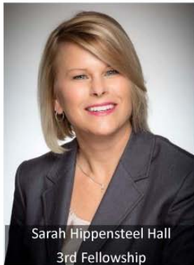
Sarah Hippensteel Hall 3rd Fellowship