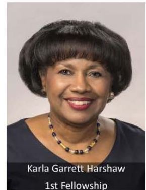
Karla Garrett Harshaw 1st Fellowship